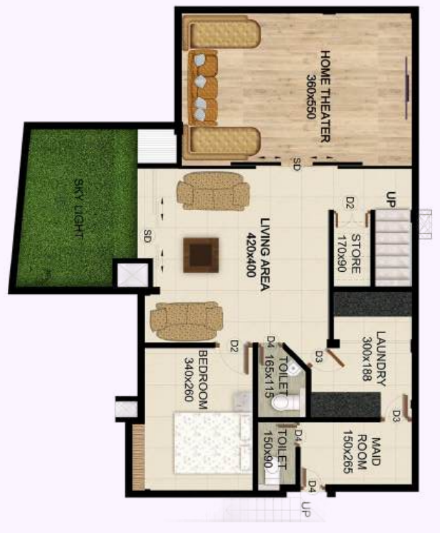
Basement Floor Area: 980 Sq. Ft.