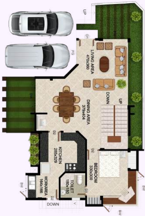
Ground Floor Area: 1100 Sq. Ft.