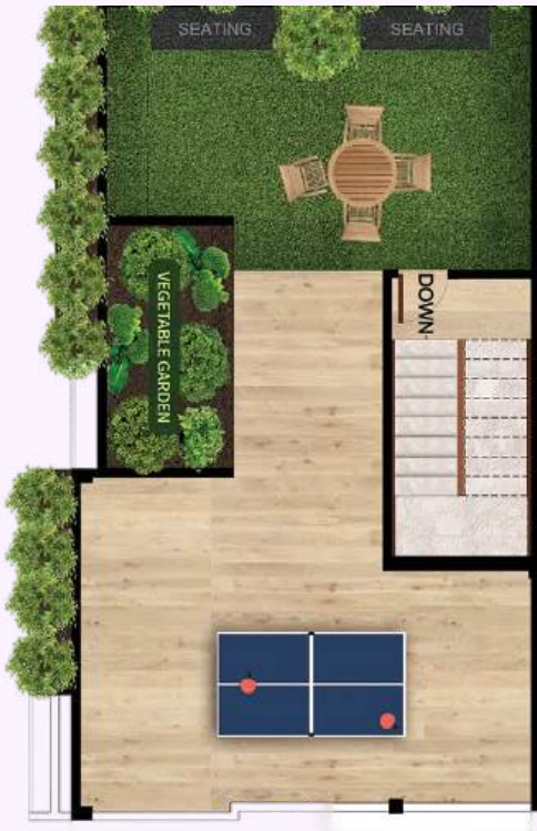
Terrace Garden with Light Roof