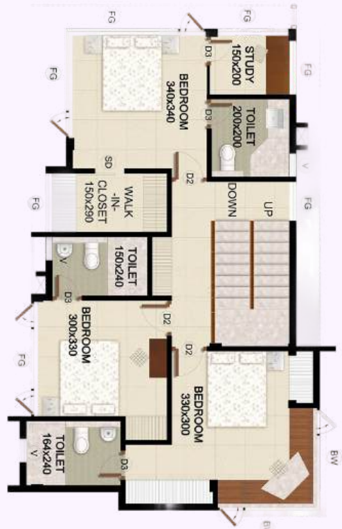
First Floor Area: 860 Sq. Ft.